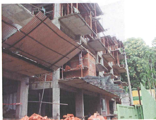
Picture 3: Equity Apartment, Mehedibag ( under construction ) Chittagong

The research team members performed site survey of Equity Apartment at Mehedibag ( under construction ). Respected Professor Sugahara (TUS) kindly gave comments on: i) The importance of two-way escape , ii) installation of fire doors , iii) fire/smoke detectors, fire drills and education for residents, etc.