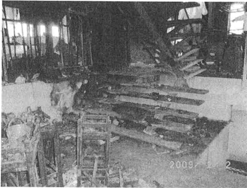
Image 2 Stairway from the seating area to the entrance hall (Figure 1 (E))

Because of the above mentioned reasons, evacuees fell over one on top of another at the space going up into the entrance hall and the largest number of victims died here.