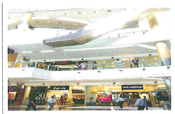
Visit of Shopping Mall