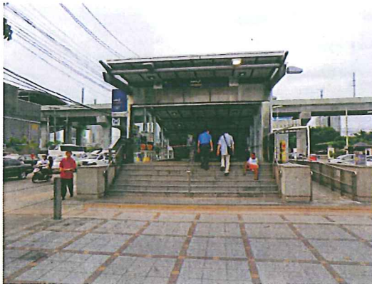
写真3 階段6段(約1.3m程度)をかさ上げて 洪水に備えている Phetchaburi 駅