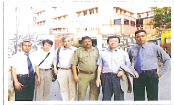
Visit of AMRI Hospital