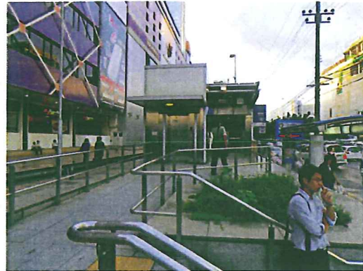
写真2 Phra Ram 9 駅のかさ上げされた 部分にあるエレベータ