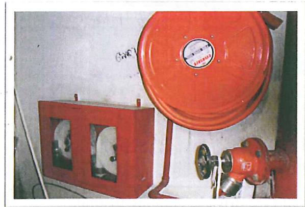
Visit of residential House