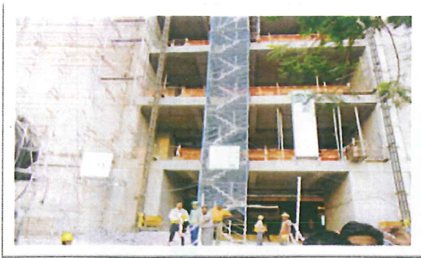
Visit of under construction Building