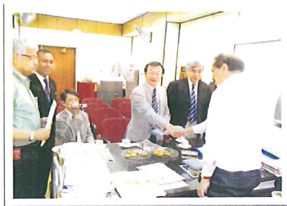
Visit of Fire Brigade Kolkata