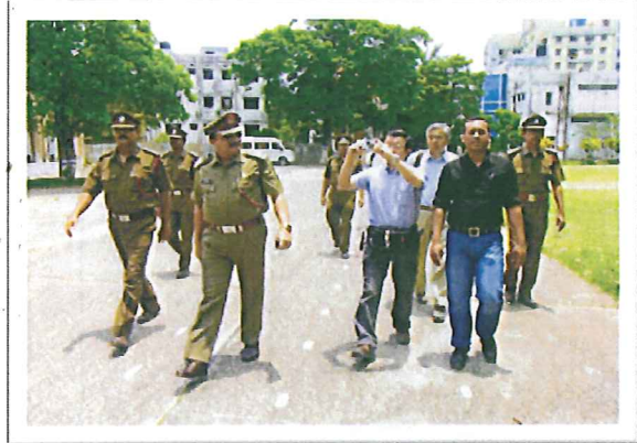
Visit of Fire Brigade Training Institute

Welcome party: A welcome party was organized by TUS on 10 May, 2012 where fire persons joined. The guests were warmly received by TUS team where the informal nitration took place for the development relationship.