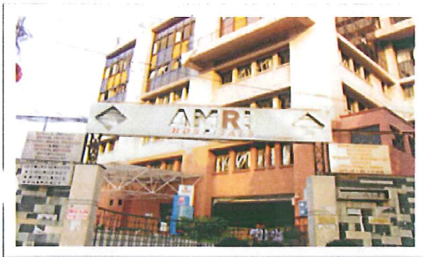
Visit of AMRI Hospital