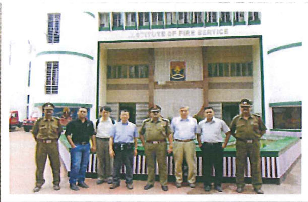
Visit of Fire Brigade Training Institute