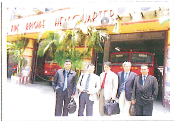
Visit of Fire Brigade Kolkata

After finished the part of West Bengal Fire & Emergency Services visit , the team visited 01 shopping mall (super market), 01 residential building, AMRI Hospital and 01 under construction shopping mall. Then next day on 11 May we visited Kolkata Fire Brigade Training Institute, Bahela, Kolkata. This whole visit was assisted by fire personals.