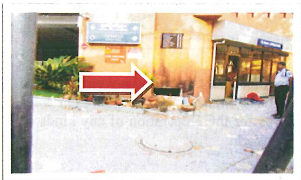
Visit of AMRI Hospital (Fire Origin)