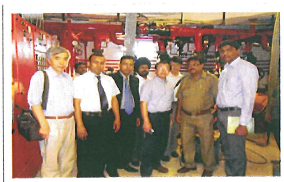
Visit of Shopping Mall