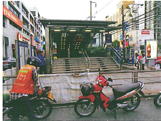
写真4 Huai Khwang 駅入口の階段(7段)