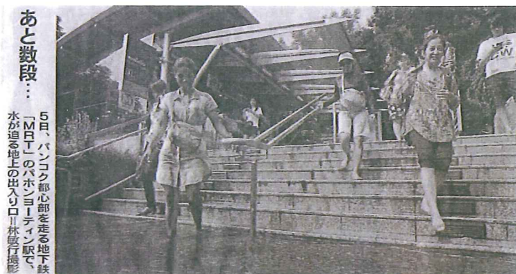
図-1 Phahon Yotin 駅出入口階段にせまる浸水