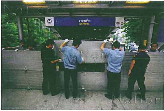
写真1 バンコク地下鉄、Lat Phrao 駅で防潮板を設置して 出入口封鎖 October 14, 2011 14:31