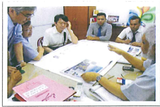
Visit of under construction Building