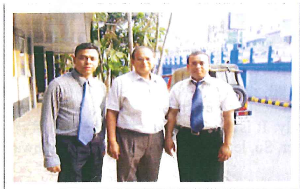
Administrative officer of AMRI Hospital