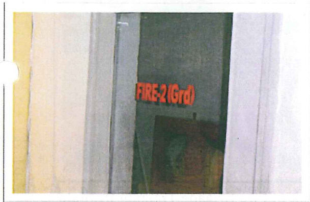
Visit of residential House